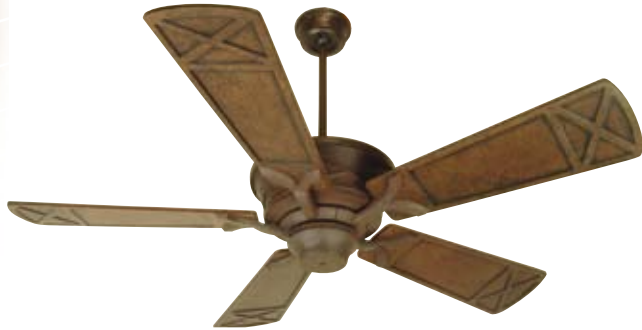
Rustic Iron Trellis with 54" Outdoor Trellis Rustic Iron Blades

Model-Finish TL52RI Blade-Finish B554X-ORI Light-Finish Not Shown