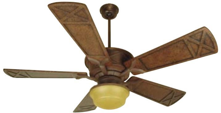
Rustic Iron Trellis with 54" Outdoor Trellis Rustic Iron Blades and Outdoor Rustic Iron Light Kit

Model-Finish TL52RI Blade-Finish B554X-ORI Light-Finish Not Shown