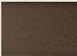
RI Rustic Iron