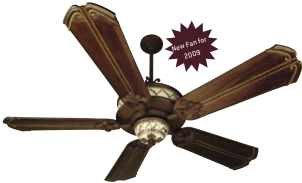
Rustic Iron San Miguel with 56" Custom Carved Chamberlain Walnut Blades

Model-Finish SM52RI Blade-Finish B556C-CH10 Light-Finish Not Shown