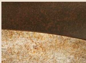
AGVM Aged Bronze/ Vintage Madera