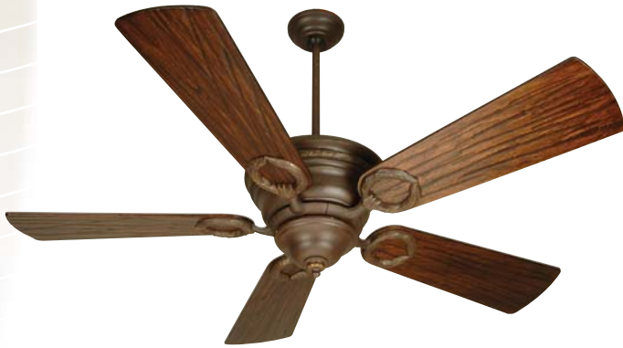
Aged Bronze La Tour with 54" Premier Hand-Scraped Walnut Blades

Model-Finish LT52AG Blade-Finish B554P-WAL Light-Finish Not Shown