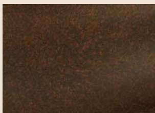
AG Aged Bronze