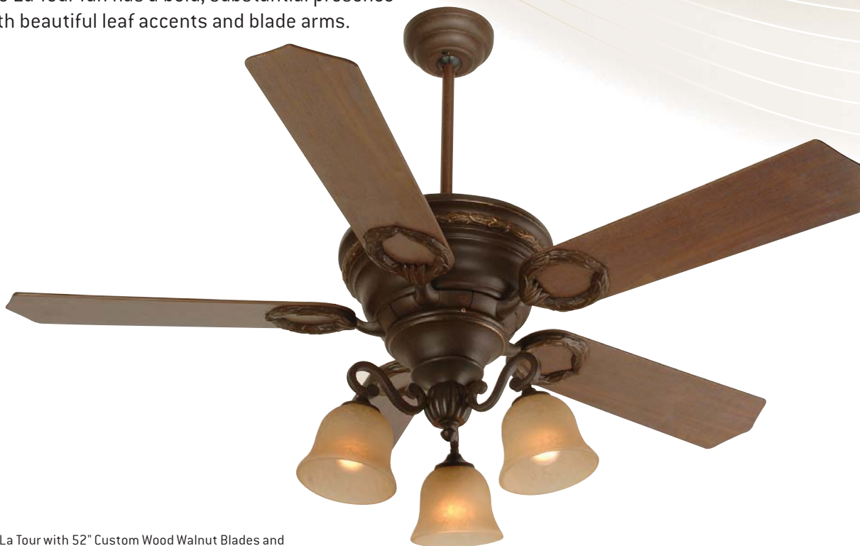
Aged Bronze La Tour with 52" Custom Wood Walnut Blades and Light Kit

The La Tour fan has a bold, substantial presence with beautiful leaf accents and blade arms.