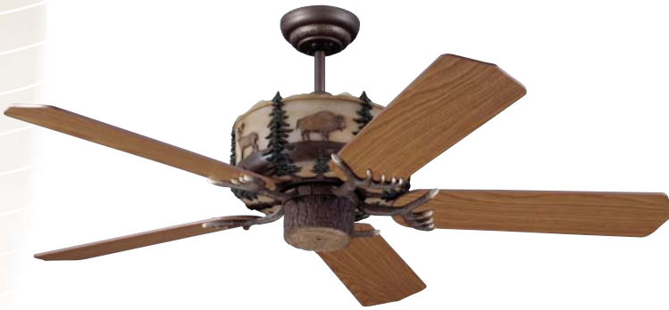
European Bronze Frontier with 52" Standard Light Oak Blades

Model-Finish FT52EB Blade-Finish B552S-LOK Light-Finish Not Shown