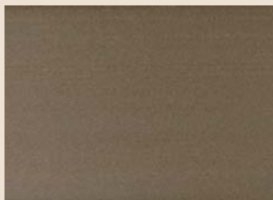
EB European Bronze