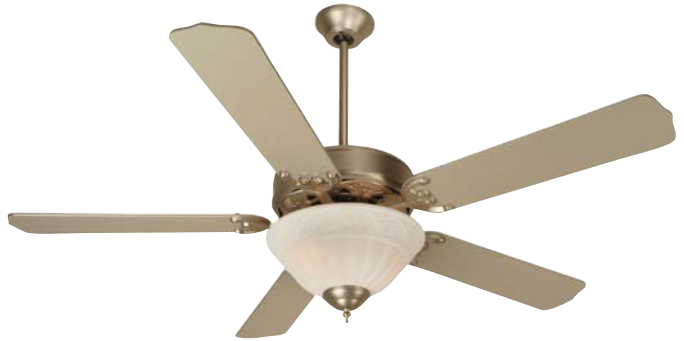
Brushed Nickel CS Unipack with 52" Contractor's Design Brushed Nickel Blades

Model-Finish CSU52AG Blade-Finish BCD52-WWB Light-Finish Included