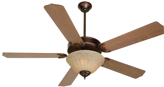
Aged Bronze CS Unipack with 52" Contractor's Design Washed Walnut Birch Blades

Model-Finish CSU52AGVM Blade-Finish BCD52-WWB Light-Finish Included