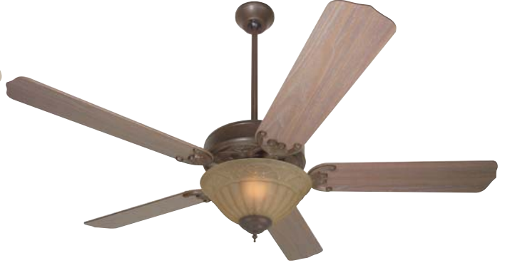
Aged Bronze/Vintage Madera CS Unipack with 52" Contractor's Design Washed Walnut Birch Blades

Model-Finish CSU52AWD Blade-Finish BCD52-AW Light-Finish Included