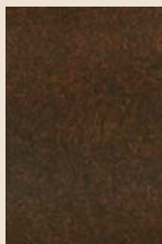
AG Aged Bronze