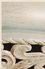
AWD Antique White Distressed