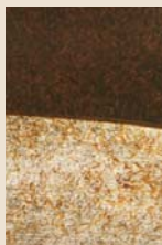
AGVM Aged Bronze/ Vintage Madera