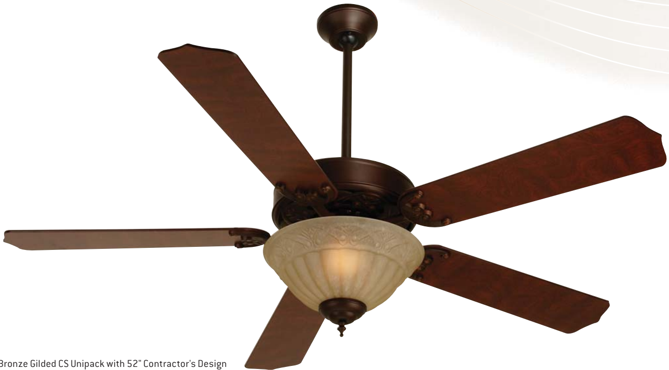
Oiled Bronze Gilded CS Unipack with 52" Contractor's Design Rosewood Blades

The Contractor's Select Unipack fan is a versatile choice that's both elegant and stylish.