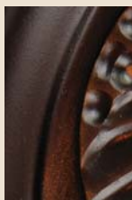
OBG Oiled Bronze Gilded