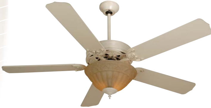
Antique White Distressed CS Unipack with 52" Contractor's Design Antique White Blades

Model-Finish CSU52AWD Blade-Finish BCD52-AW Light-Finish Included