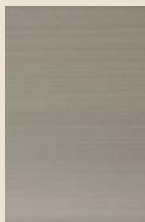
BN Brushed Nickel